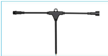
T connector with two naked wires