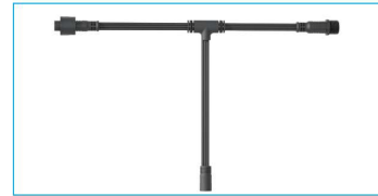
T connector with DC