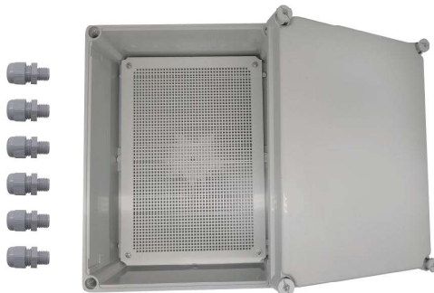
waterproof box with accessories Power supply+Protection Circuit+Controller+Waterproof electric box